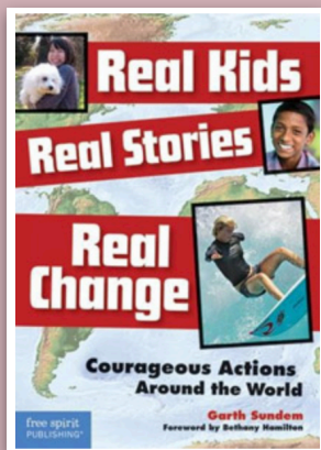
Real Kids, Real Stories, Real Change (Garth Sundem)

Inspire kids and teens to personal, community, and social action with this book of thirty true stories of young people overcoming adversity to achieve great things and make a difference around the world. Compelling, funny, inspiring, and poignant, the book features kids and teens who used their heads, their hearts, their character, their courage, and sometimes their stubbornness to help others and do amazing things. You'll find examples of kids volunteering, kids making a difference, and young people initiating community and social action to change their world.